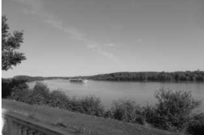
We stayed by the beautiful river Danube.

And then I started to think and God also talked to me. He said: