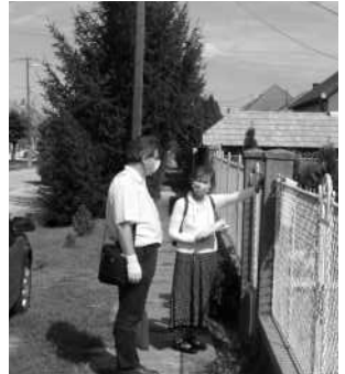
With masks and gloves...

We talked to people, but not everyone was interested to find out about Christ. Several people just wanted a chat. We talked to an elderly man, but when we mentioned Jesus, he did not say anything. It seemed as if he had not heard us. I feel sorry for him.