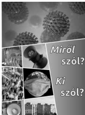
The cover page of the booklet...

When the epidemic reached our country in March and restrictions were introduced, we asked ourselves the same questions over and over again: What would God like to tell us through this? In this situation, what can we say to people around us? This made us prepare the above mentioned publication. We sent more than 26 000 copies of it to EHC volunteers and partner churches, so that they could distribute it. Several churches sent it to all families in their villages. Then we thought that it might be a good idea to make it available so that people could listen to it, not just read it, especially since a lot of people nowadays prefer to listen to something. Several brethren helped us to make a video version and we have already shared it with hundreds of people. Both versions are available on the new website of EHC, and we can share the link or content with acquaintances, friends and family. There is a pdf file and a video. We would like to thank those who have read the text and the editor of the video for their help.