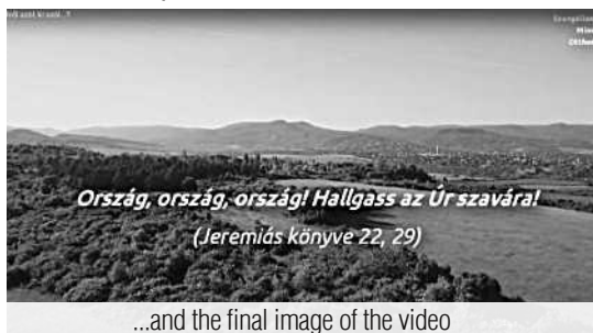
...and the final image of the video

We are grateful that we could prepare this publication in two versions and that it has already reached a lot of people. Let us pray for those who have read it and watched it, that they might listen to the words of God and take steps towards him.