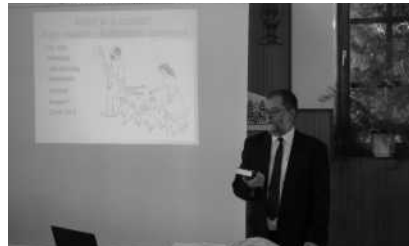
Lecture at church

Let us pray for the inhabitants of Gönyő, for the activities of the church and the pastor. We believe that the seeds we have sown will grow, whether we see it or not.