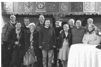
EHC team with local church members

appr. 2 000 people live altogether in 9 villages (state statistics). The situation of spirituality is similar – we found that many people were burdened with different kinds of occultism, besides, conflicts and harms in the deep was present, as well as envy, poverty and hopelessness. We also experienced that many hearts hardened against God and the Bible. Thanks God, we also met people who were open and seeking for God,