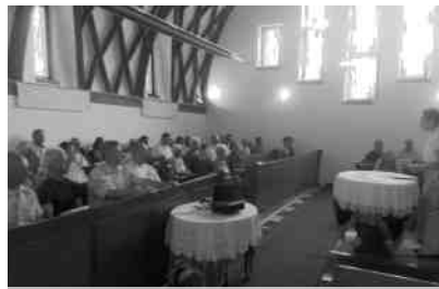
Personal testimony at the church

This week was finished with a thanksgiving sermon, where we invited the inhabitants of the town. Thanks God, the small building of the reformed church was full on Sunday morning. Thus, we could listen to the message, songs and the two testimonies together with them. We gave thanks to God together with the congregation for keeping