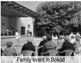
Family event in Bokod

After mostly two decades I participated again in distribution of EHC tracts in Bokod . On the one hand, it was a bit odd, but on the other hand it was a joy