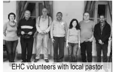
EHC volunteers with local pastor

Together with some fellows we arrived to the village situated at the foot of Börzsöny hill on Friday afternoon, and after a short discussion and prayer time we left to visit as many homes as we could until dark. On Saturday other fellow volunteers and local fellows joined us and we left to invite people and give testimony.