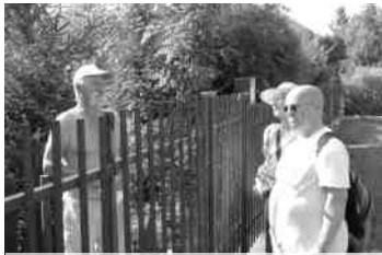
A good conversation at the gate

In the afternoons and all day on Saturday we went about the town, knocked