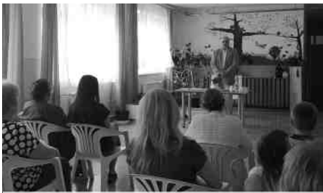
Evangelistic event in the local school building